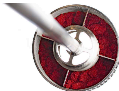
Fig 1. An open SpinChem® rotating bed reactor (RBR) S3, filled with ion exchange resin after an uptake of Allura red dye.

The SpinChem® rotating bed reactor (RBR) is an alternative to conventional techniques used for heterogeneous reactions, such as STRs and fixed bed reactors. The RBR consists of a hollow cylinder into which the solid phase material is packed. As the RBR is spun in solution, the fluid is forced through the packed bed of particles inside by the centrifugal forces created. Each fluid parcel makes multiple passages through the packed bed at high flow rates. The design of the RBR thus creates a strong convective flow of liquid to the particles, achieving efficient mass transfer, independent of the Stokes number.